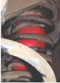
LAN23 Rear Land Rover Defender 130 (Internal Coils Retained)

Holds extra 476 Kg @ 2.5 Bars Max for the axle. Shock absorber are relocated outboard of the coils.