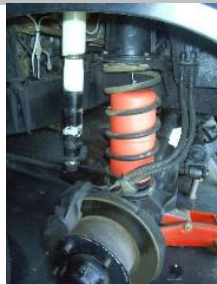
LAN06 Rear LandRover Range Rover < 96

Holds extra 476 Kg @ 2.5 Bars Max for the axle.